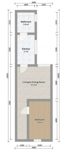
Milner Road Ground Floor