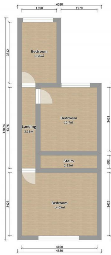
Milner Road First Floor